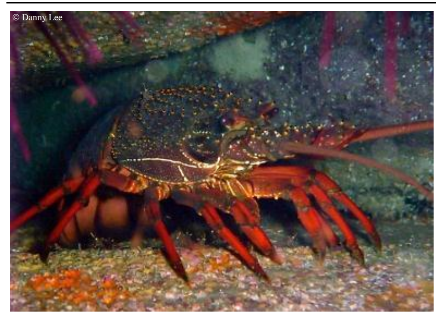
Plate 1. The eastern rock lobster ( Sagmariasus verreauxi ) is the most reported species on the Redmap website, observed in areas along the Tasmanian east coast that are not considered part of its historical range